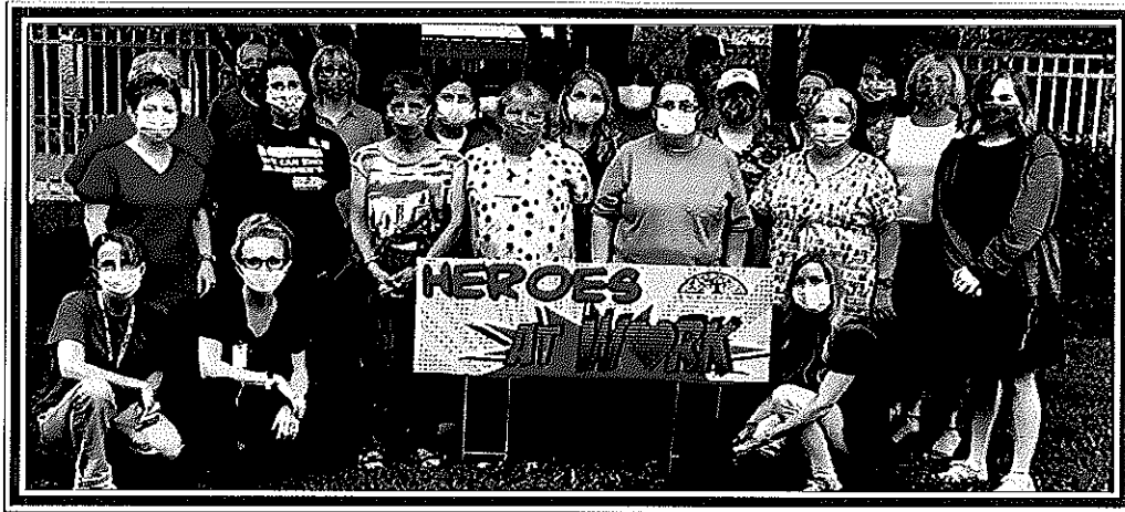
Some of our heroes at WNCBH in Asheville

to North Carolina Baptist Associations and Churches