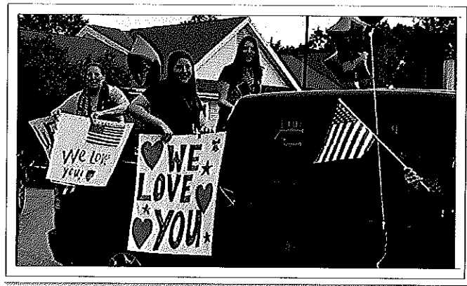
Family members parade residents at Taylor Glen during quarantine.